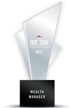
The Five Star award goes to wealth managers rated highest in overall satisfaction by clients, peers and industry experts.

From research conducted by Five Star Professional, April 2011.